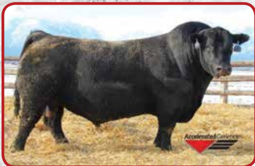
Coleman Charlo 0256, Sire

REG#19290407 BD: 2-17-18 Tattoo: 895 BW: 60 Adj. WW: 570 Adj. YW: 852