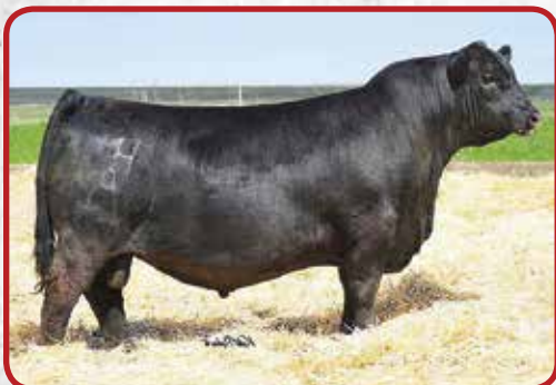
HA Cowboy Up 5405, Sire

REG#19291413 BD: 3-2-18 Tattoo: 8102 BW: 78 Adj. WW: 657 Adj. YW: 897