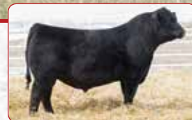
MOGCK Entice, AI Sire

A cow that ranks in the top 20% for $B with a value of 137 as well as the top 20% for milk with a value of +29. Out of a really good Rocky daughter, this girl is big footed stout boned while still possessing that really good maternal cowy look. Performance and maternal quality on foot and paper make this girl a true sale highlight.