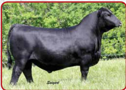
Chestnut Undisputed GLM, Sire

REG#19290415 BD: 3-5-18 Tattoo: 8106 BW: 67 Adj. WW: 593 Adj. YW: 815