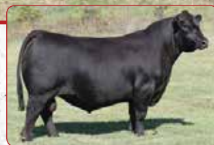
Stevenson Turning Point, AI Sire

Rugged or Stout are two terms that we would use if we would have to describe this female in one word. Tons of power and performance in this gal with tons of longevity as her mom is still in production here at Chestnut Angus. A phenotypic beast who continually passes that on to her progeny.