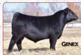
BUSHS High Caliber, AI Sire

A.I. Sire: BUSHS High Caliber on 6-5-19 Safe to AI • Due approx 3-12-20 Pasture Sire: Chestnut Undisputed WJ 338 from 6-10 to 8-1-19