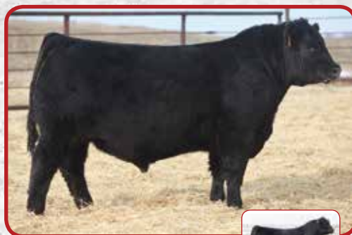
Brooking Asset 5065, Sire

Connealy Consensus Connealy Earnan 076E Brazila of Conanga 3991 839A Brooking Asset 5065 S A V Final Answer 0035 E A Rose 918 E A Rose 738 MCC Daybreak Woodhill Daybreak U280-X20 Woodhill Evergreen 285M-U280 Chestnut Winnie 57 VAR Rocky 80029 Chestnut Winnie 322 Chestnut Winnie 023