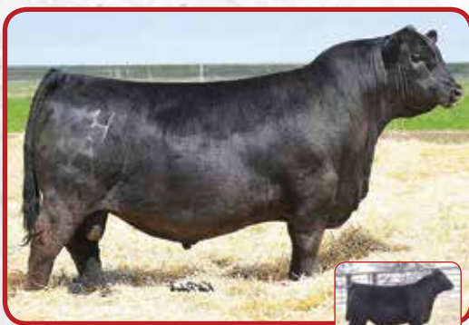
HA Cowboy Up 5405, Sire