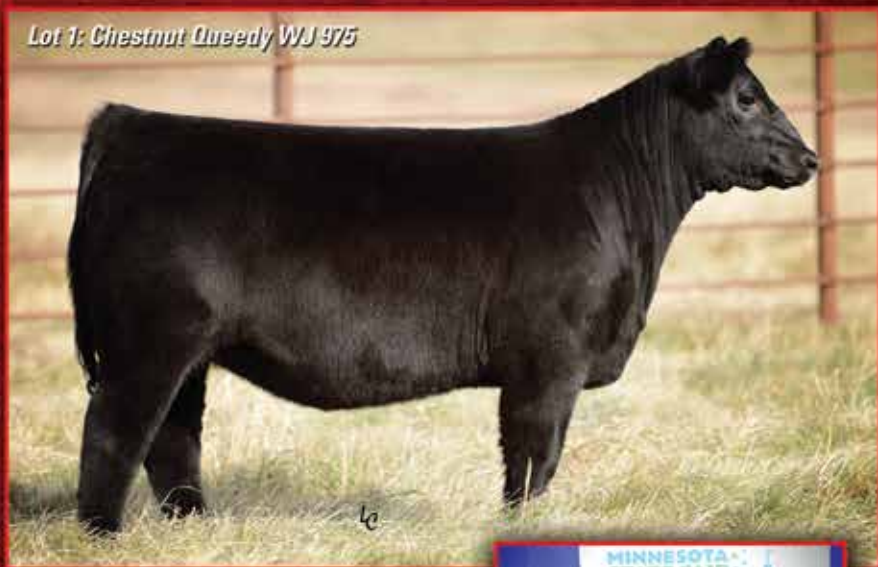
Lot 1: Chestnut Queedy WJ 975

Maternal Sister to the 2019 Reserve Champion Female MN State Fair & 2019 Reserve Champion Angus SD State Fair!