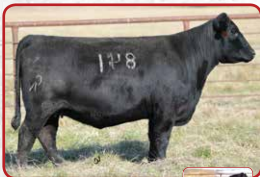
Ellingson Homestead, AI Sire

Gambles Royal Flush Visiontopline Royal Stockman LaGrand Pride 7140 Chestnut Royal Stockman 326 KF Danny 387 CN Queen Mab 271 Cnqueen Mab 7157 LaGrand Sun Dance 4211 Plainview Sun Dance G39 S C C Beauty 2100 CN Elaine 9309 WK Wacker CN Elaine 646 Chestnut Elaine 320 321